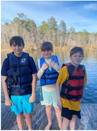
Brave Youth Taking the Polar Plunge!