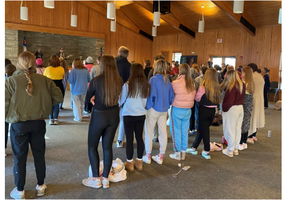
A worship service at the retreat center.