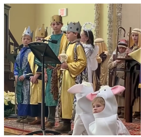
Kings and Shepherds