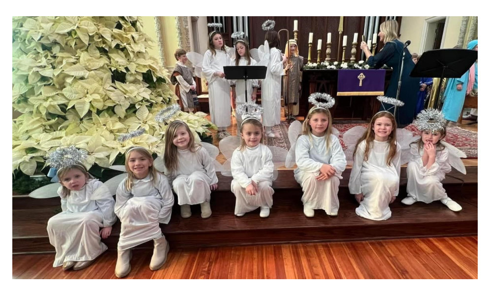
NATIVITY PAGEANT December 17, 2023