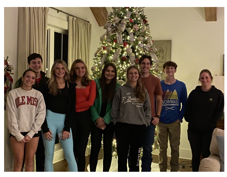
Senior High Christmas Party