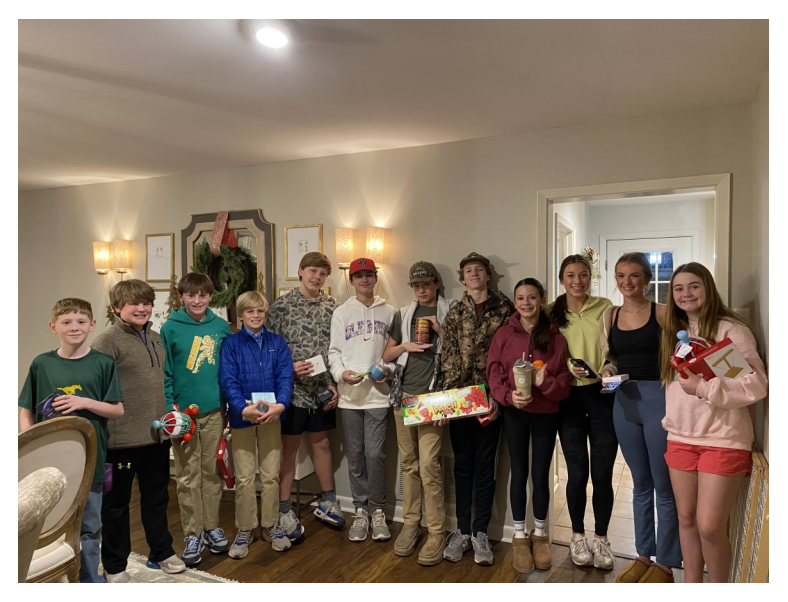
Junior High Christmas Party