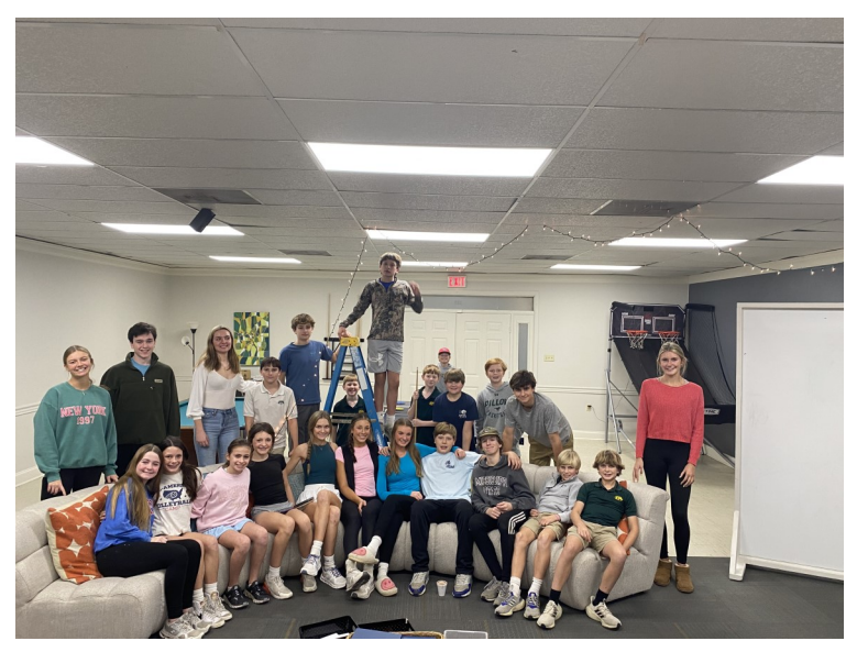
Youth Decorating the Shed