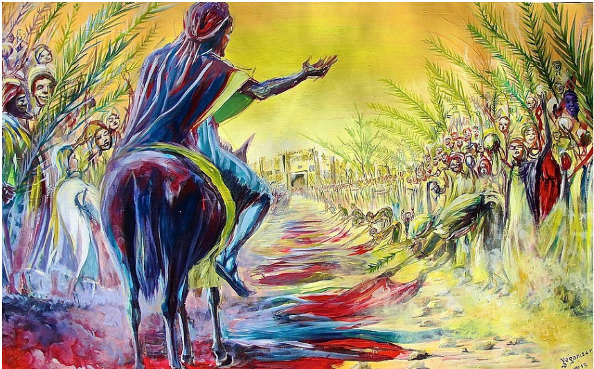
The Entrance of Jesus Into Jerusalem